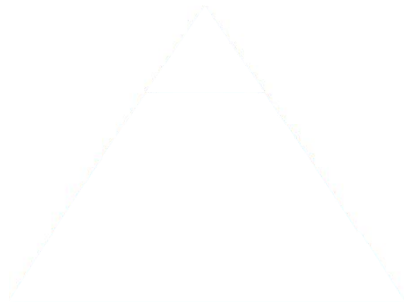
Figure1: Measurement model